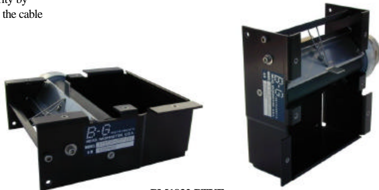
PM1832-PTVF Print Mechanism

When driven by a CB2832 the PM 1832 Print Mechanism can print approximately 125 dot rows per second (somewhat slower for rows containing more than 64 printing dots). At .005" per step, the maximum paper speed is about .5 inches (13 mm) per second. Rows of 5x7 characters can be printed at a rate of about 5 lines/second. When driven by the CB3832 the PM1832 10:1 Print Mechanism can operate at selectable print speeds up to 1.85 inches (47 mm) per second.